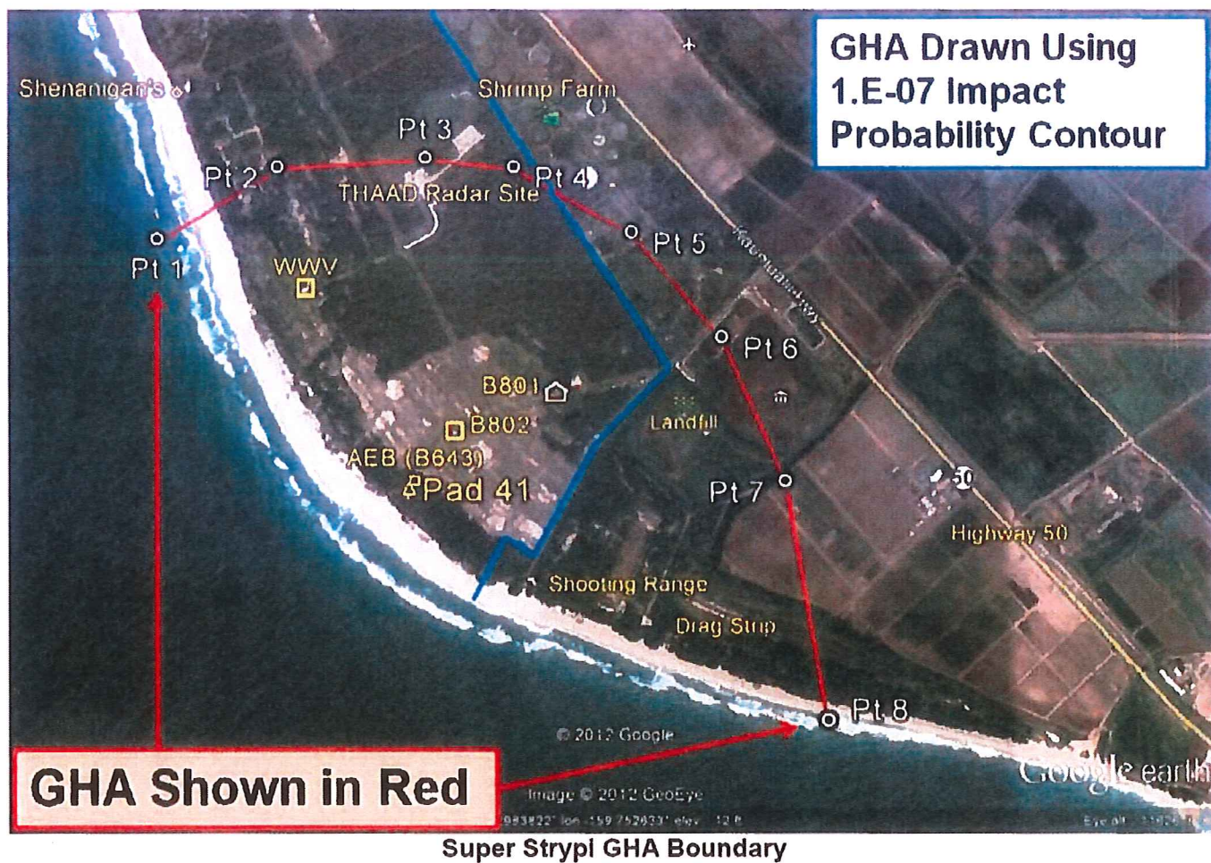
EXHIBIT 1 TO DLNR APPLICATION