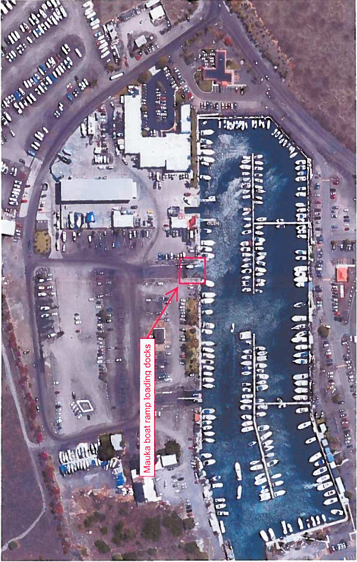
Honokohau Small Boat Harbor Mauka Boat Ramp Loading Dock Replacement – Location Map Job No. HA14-03