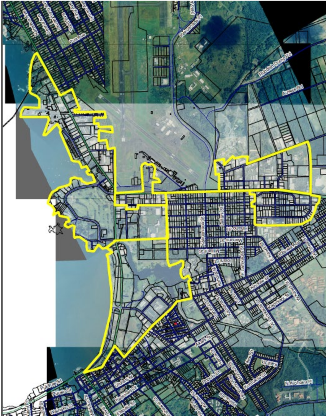
Hilo Community Economic District under Act 149, Session Laws of Hawaii 2018