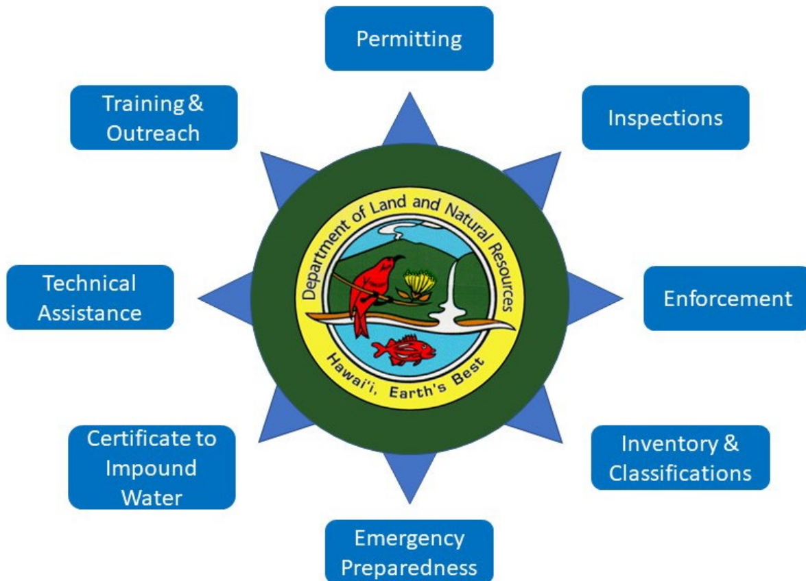
Figure 2: Core Functions of Dam and Reservoir Safety Program.

Dam Safety Inspections: The Department staff routinely inspects regulated structures statewide and retains consultants as necessary to assist with the assessments. Staff conducted 45 dam safety inspections, construction site visits and informal inspections in FY 2024. The list of the dams inspected in this fiscal year is described in Dam Safety Activities Section B of this report.