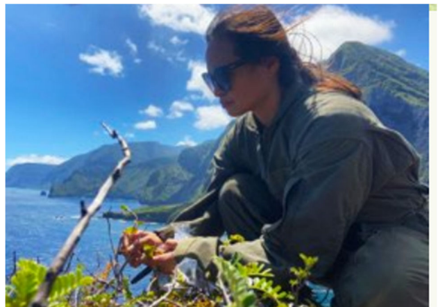
Monitoring an endangered species of naupaka on the north shore of Molokai.