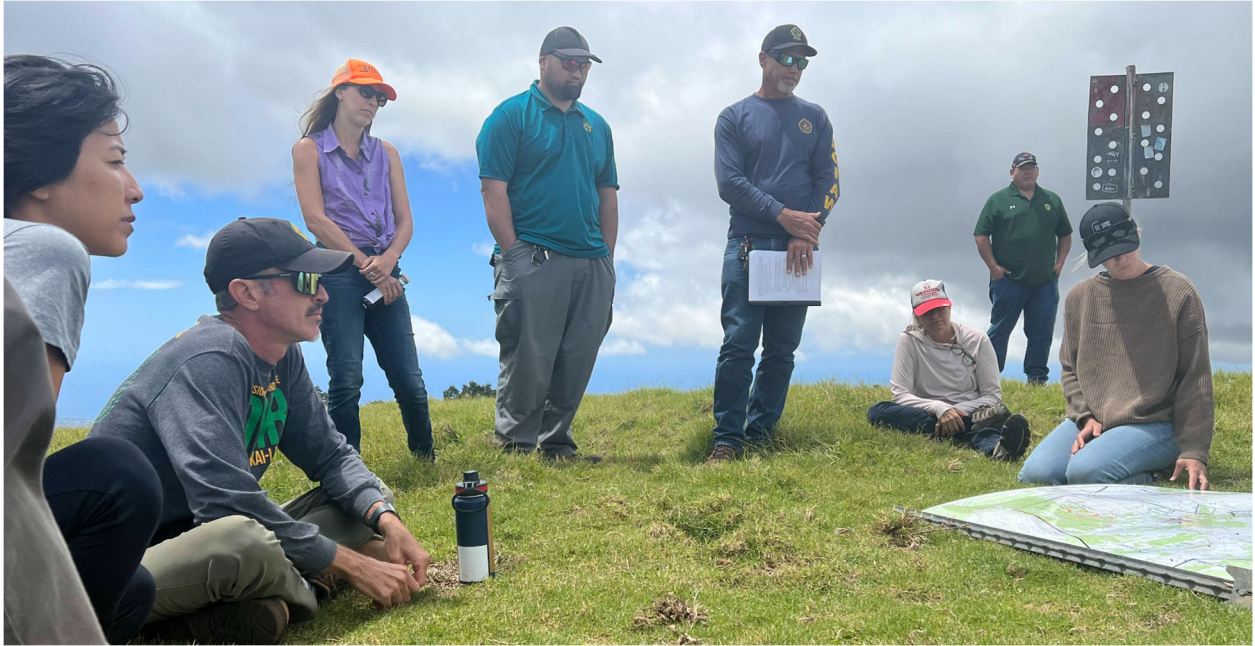
Legislators learning about wildfire prevention and preparedness at Pu'u wa'awa'a, Hawai'i.