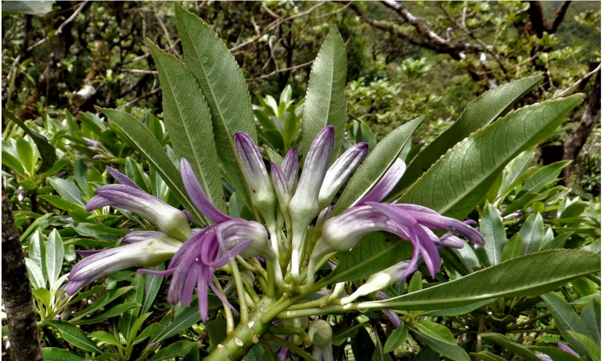
Clemontia hanaulaensis , a new native plant species discovered by the Maui Nui Plant Extinction Prevention Program on Mauna Kahalawai, Maui