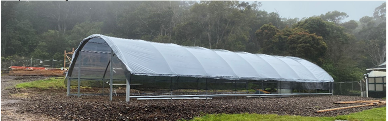
A new nursery facility has doubled our capacity for growing rare plants at Koke'e, Kaua'i