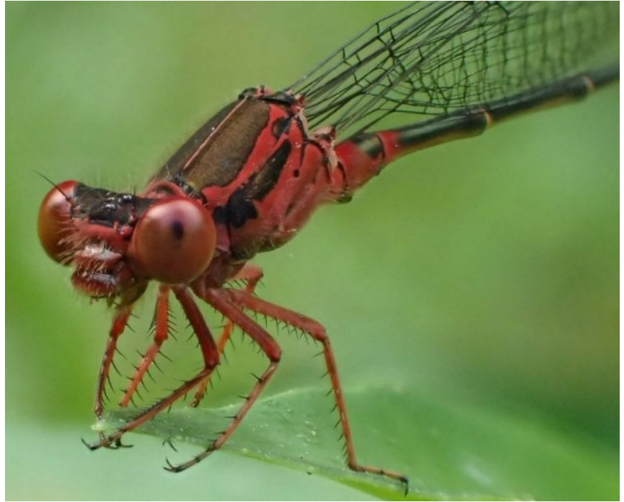
Hawaiian orange-black damselfly.