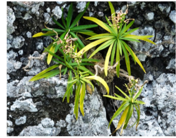
An unknown Lobelia species was found through drone surveys in remote cliffs of Kualoa on O‘ahu. New plant species are still being discovered during surveys of remote areas.

Hawai‘i Invertebrate Program: Insects and other invertebrates are experiencing catastrophic declines worldwide and those declines have a cascade of impacts on native ecosystems and people. Hawai‘i is no exception to this trend, which is why Hawai‘i Invertebrate Program seeks to stabilize and recover rare native invertebrate species through captive rearing, translocations, habitat enhancement, research, and policy. HIP includes the Snail Extinction Prevention Program, a partnership with the U.S. Fish and Wildlife Service. Estimates suggest that over 100 snail species are facing imminent extinction.