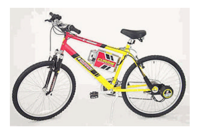
Currie E-Ride Electric Mountain Bike (FREE SHIPPING)