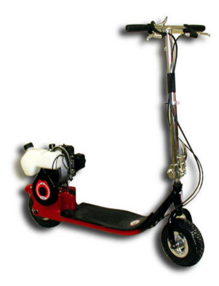
Tiger Mosquito Gas Scooter (FREE SHIPPING)