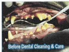
Before Dental Cleaning & Care

We are a small hospital with a staff that takes the time to know the patient and the owner. Appointments are scheduled for 30 minutes to allow ample time to discuss your pets' health and needs.