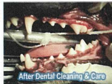
After Dental Cleaning & Care

We prefer appointments only as this helps us ensure your pet will get the attention and care they deserve. To set up an appointment, please call us at 325-6637. Urgent care and emergency appointments are scheduled on a case-by-case basis. Please call our office, so we may advise on how best to proceed.