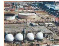
Digesters at Terminal Island