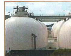
Digesters at Hyperion